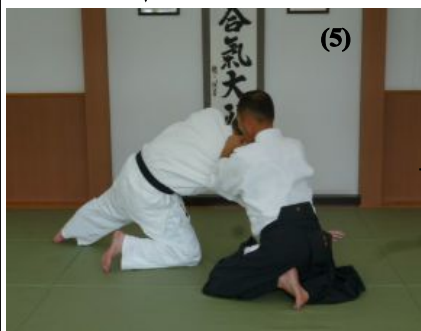
(5) Shite enters using the blade hand, pulling the hand holding uke's collar slightly towards you to help twist and unbalance uke..