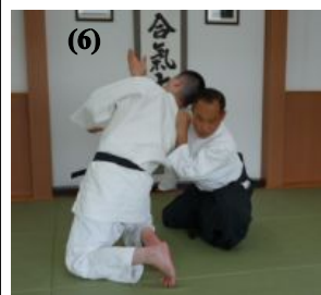
(6) At this point, shite should keep their center low and enter with the right shoulder.