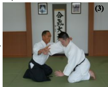
(3) Shite brings uke forwards, using their blade hand to lead uke, and reaches for the collar.