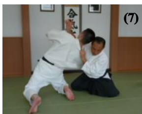
(7) Open with the knee slightly when lowering the knee to the mat and twist the hips.