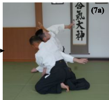
(7a) Shite opens with the knee slightly when placing the knee on the mat; drops their center and pulls up the back leg.