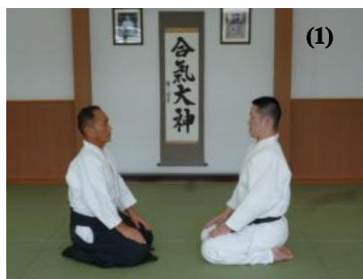
(1) From kamae; move in and into seiza. Keep a slightly larger distance between you and your partner.