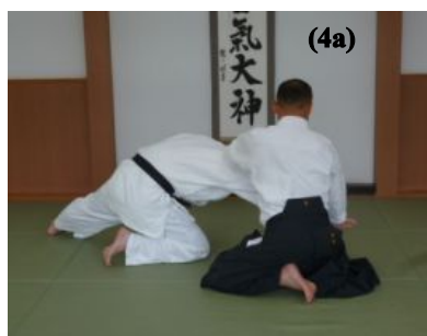
(4a) Grabbing uke's collar, make a large pivot and break their balance.