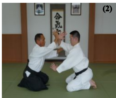
(2) Shite and uke raise their hands together and shite blocks the strike from uke.

This is the 3rd set technique for 1st-3rd kyu. Important points in this technique are how you grab uke's collar; the movement of your hips and center when turning; raising uke and entering. Before throwing; make sure your weight and your center are dropped and your center of gravity stays low.