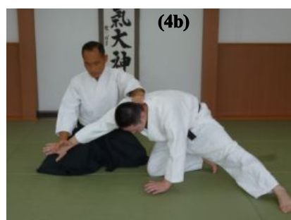
(4b) 4a seen from another angle. The blade hand leading uke forwards should be positioned above your knee at this point.

https://www.aikidoru.or.jp/product/aiki-ryu-newspaper/