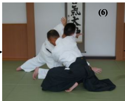
(6) Shite stands with the knee to move forward, raising uke.