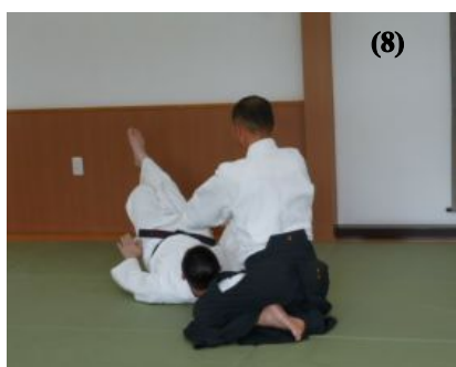
(8) Shite steps forward with the inside leg to throw uke.