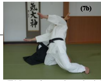
(7b) 7a seen from another angle, uke's balance is broken. Shite is fitted close to uke applying pressure with their shoulder.